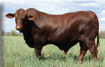
QUARTERBACK 21 MTHS