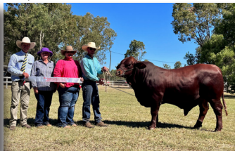
QUEENSLANDER - SUPREME EXHIBIT