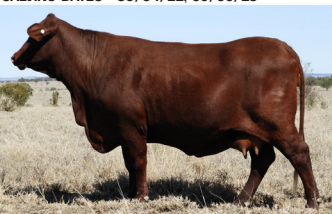
DAM - NURSE 4 YRS