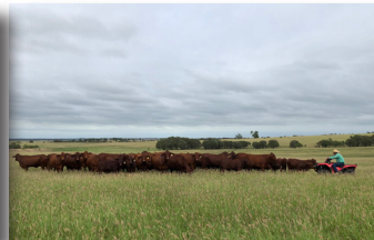
WELL HANDLED TO SUIT ANY OPERATION