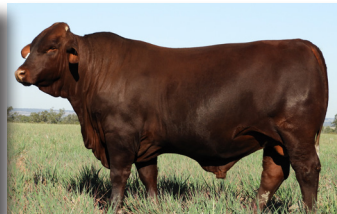
QUEST 22 MTHS