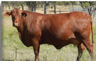
GRAND DAM - ELEGANT 6 YRS