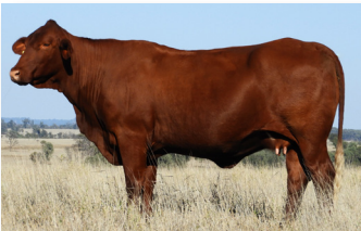
20 DAM - INDIGO 7 YRS

CALVING DATES 08/03/17, 04/08/18, 01/09/19, 23/09/20, 09/09/21, 27/09/22