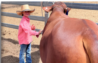
QUALIFY 9 MTHS & AYLA