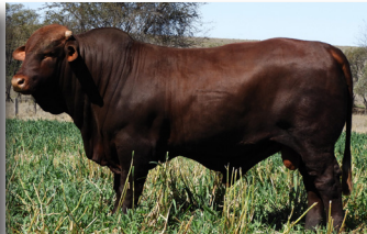
FULL BROTHER ($22000)