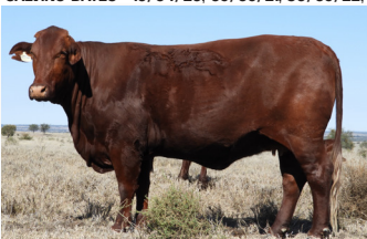
DAM - L327 6 YRS

CALVING DATES 18/04/20, 09/09/21, 30/09/22, PTIC