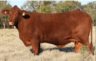
DAM - WILLA 4 YRS

CALVING DATES 12/11/20, 18/10/21, 21/01/23, PTIC