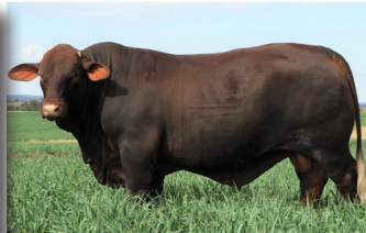
FULL BROTHER ($17500)