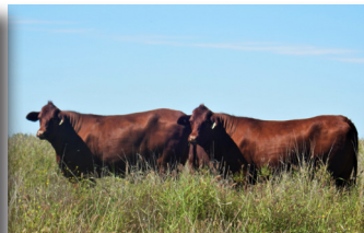
IDENTICAL TWINS 2 YRS