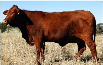
DAM - HANAH 5 YRS

CALVING DATES 11/03/16, 07/08/17, 05/10/18, 24/12/19, 04/11/20, 28/09/21, 08/09/22, ET