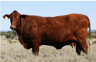
DAM - LICORICE 6 YRS

CALVING DATES 01/03/20, 31/08/21, 23/09/22, PTIC