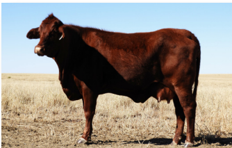
DAM - IMP 3.5 YRS

CALVING DATES 04/03/17, 05/08/18, 29/10/19, 29/09/20, 08/10/21, 23/09/22, PTIC