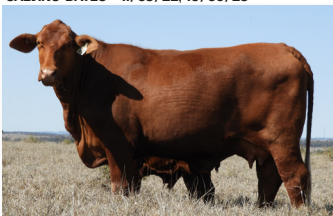
DAM - NYLA 4 YRS