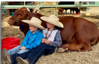
QUICKDRAW 8 MTHS & HIS MATES