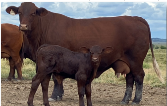
DAM - KASEY 6 YRS

CALVING DATES 20/04/19, 19/09/20, 25/09/21, 17/11/22, PTIC