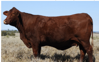
DAM - LACE 6 YRS

CALVING DATES 22/04/20, 10/10/21, 28/10/22, PTIC