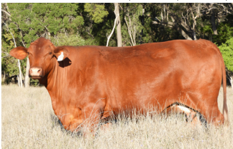
DAM - L312 6 YRS

CALVING DATES 07/05/20, 03/09/21, 29/10/22, PTIC