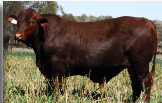
PRESIDENT 17 MTHS