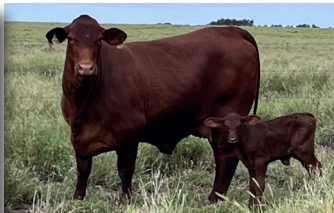
MATERNAL SISTER & NEWBORN CALF