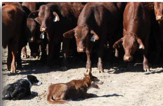
WELL HANDLED TO SUIT ANY OPERATION