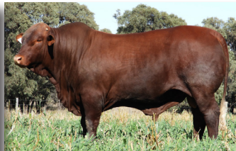
MATERNAL BROTHER ($18000)