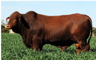
42 MATERNAL BROTHER ($11000)

CALVING DATES 04/03/17, 26/07/18, 28/08/19, 15/09/20, 01/10/21, 28/10/22, PTIC