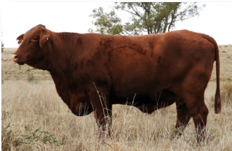
DAM - L328 6 YRS

CALVING DATES 19/05/20, 18/12/21, 28/01/23