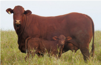
GRAND DAM - FELICIA 4 YRS