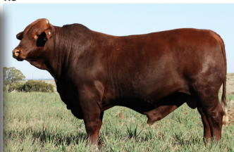
QUANTITY 23 MTHS