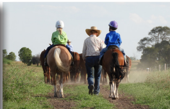
WELL HANDLED TO SUIT ANY OPERATION