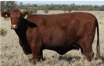
DAM - M122 3 YRS

CALVING DATES 13/11/20, 15/11/21, 13/10/22, PTIC