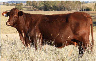
DAM - EMPRESS 8 YRS

CALVING DATES 29/07/13, 31/08/14, 21/09/15, 30/08/16, 04/09/17, 15/08/18, 26/09/19, 19/10/20, 08/09/21, 31/08/22, PTIC