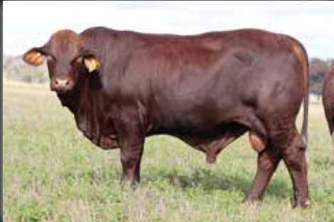
Lot 4 Watasanta Stetson 2796 (PS) Sold $40,000 to Yulgilbar Pastoral Co