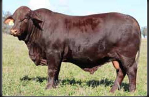
Lot 6 Watasanta Six Shooter 2814 (P) Sold $24,000 to Donoghue Family, Quirindi