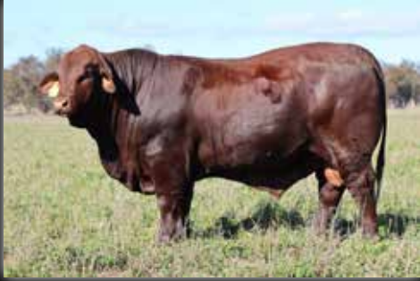
Lot 3 Watasanta Soggy Pants 2828 (P) Sold $35,000 to Norm Black, Airedale