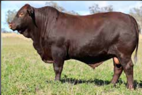
Lot 5 Watasanta Shot Gun 2812 (P) Sold $24,000 to Walker Family, Strathmore