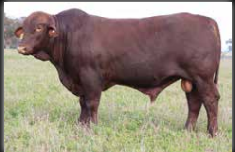
Lot 15 Watasanta Superbly 2744 (P) Sold $38,000 to Hatton Family, Diamond H