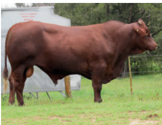
Rosevale Park Oyster E12