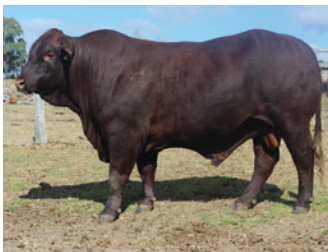
Rosevale Park Beaumon J8