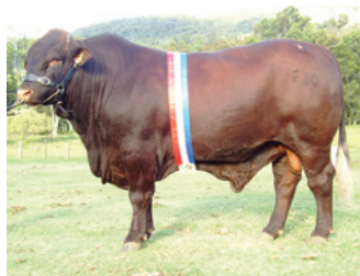
Rosevale Park Marshall F10