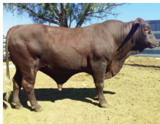
Rosevale Park Beaumon M12