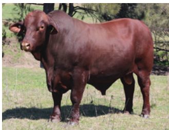
Rosevale Park Beaumon K20