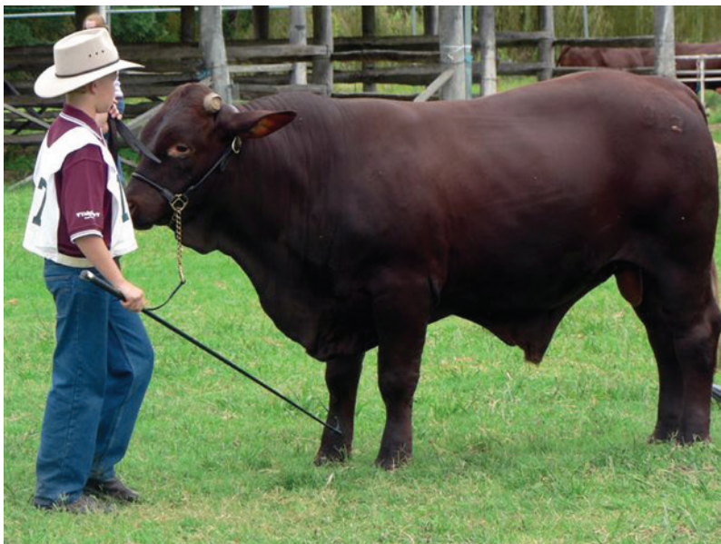
Rosevale Park Marshall B12