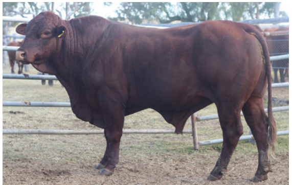
Rosevale Park Pharaoh H4

Silverdale Santa Gertrudis is offering 4 quality young heifers that will be an asset to any herd and have been running with Rosevale Park Pharaoh H4.