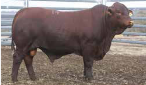
WARENDA NAIROBI (PS)