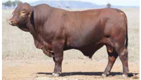
DRENSMAINE EXTOL E222 (PP)