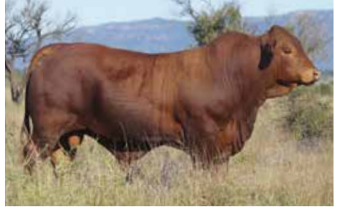
CARDONA VOLUME (PP)