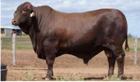
CARDONA PERFECTO (P) Lots 12, 22, 25, 29, 48, 51