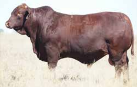
CARDONA TROOPER (PS)