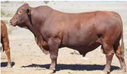
DRENSMAINE COLONEL C62 (PP)