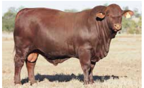
JAMAR QUICK DRAW Q31 (PS)

S: Glenn Oaks Jibba (P) D: Pampoola 376G