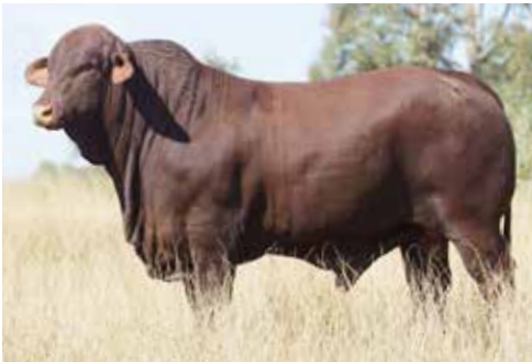
JAMAR PRESIDENT 06P (P) Lots 17, 41

Sold at auction in 2019 for $32,000 we retained a semen right and offer his first progeny.