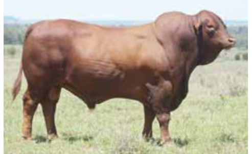
CARDONA TENNESSEE (P)