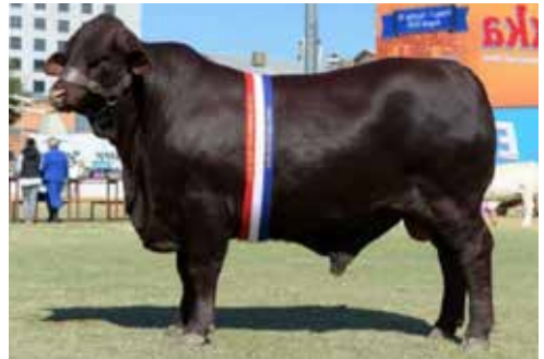
WAVE HILL JAGER J14 (PS) Lot 38

Sold at auction in 2019 for $32,000 we retained a semen right and offer his first progeny.