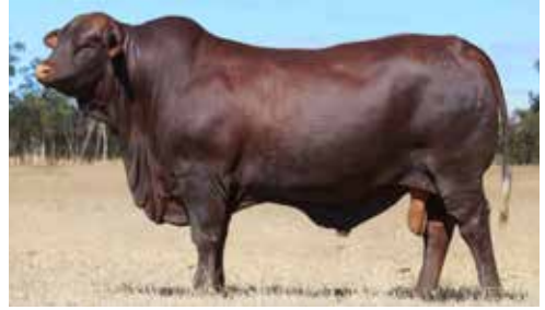
CARDONA QUEBEC (PP) Lots 27, 50, 53, 57, 59