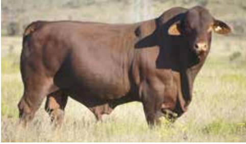
YUGILBAR NAVIGATOR (P)