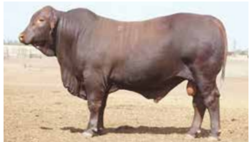
CARDONA SUPERMAN (PP)