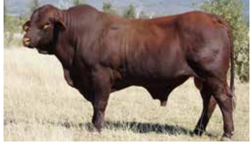
WARENDA HOUSTON H26 (P)