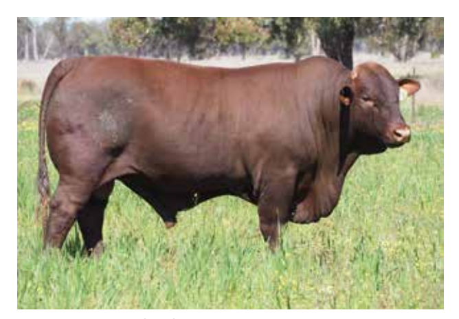
Rockingham Rogue R176 - Lot 3