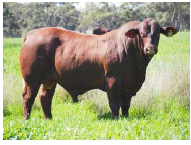
Rockingham Roulette R140 (P) - Lot 5