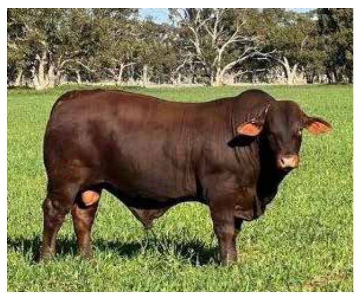
Rockingham Riverina R210 - Lot 13