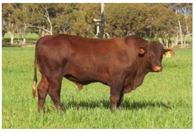
Rockingham Ritchie R134 (P) - Lot 12