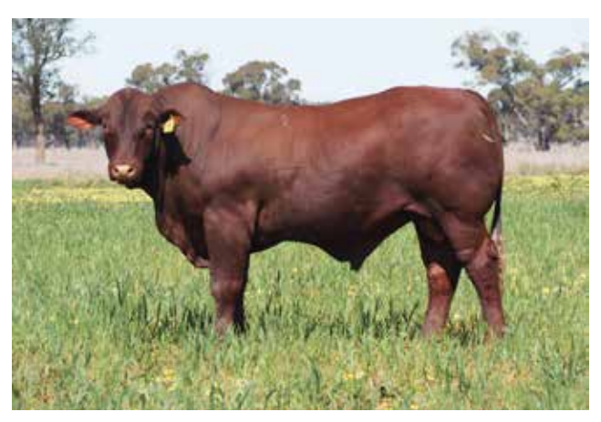
Rockingham Romano R130 (PS) - Lot 10