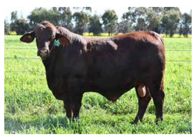
Denngal Ruben R52 (P) - Lot 27