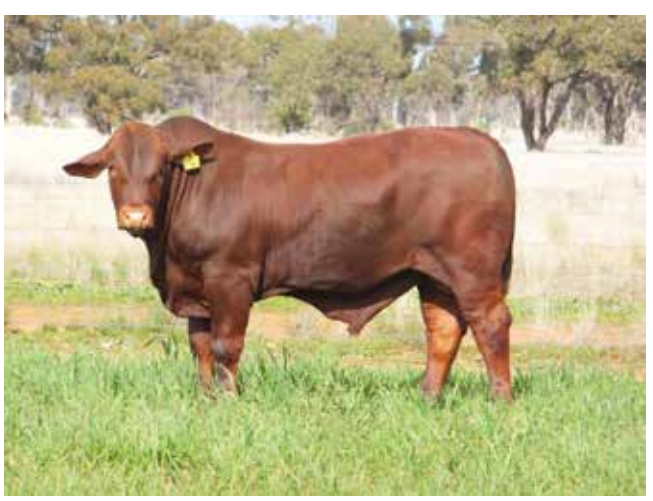
Rockingham Ringo R14 (P) - Lot 2