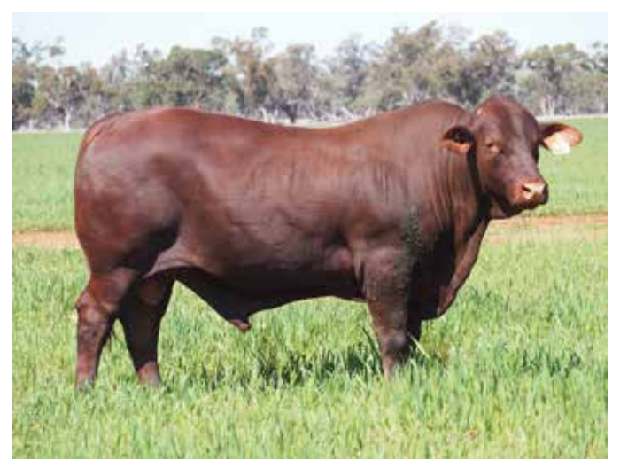
Rockingham Rufus R204 (P) - Lot 1