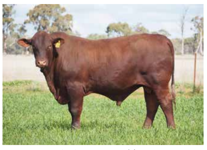
Rockingham Rover R118 (P) - Lot 4