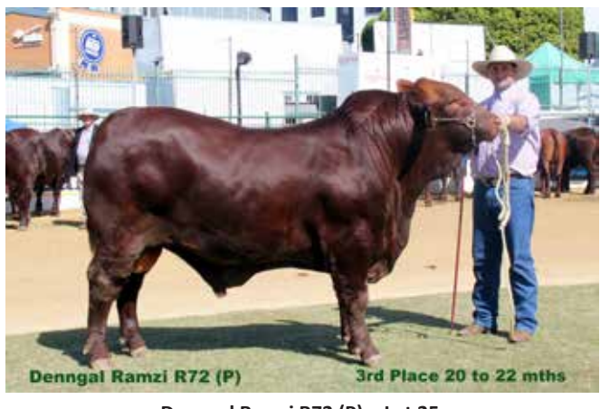
Denngal Ramzi R72 (P) - Lot 25