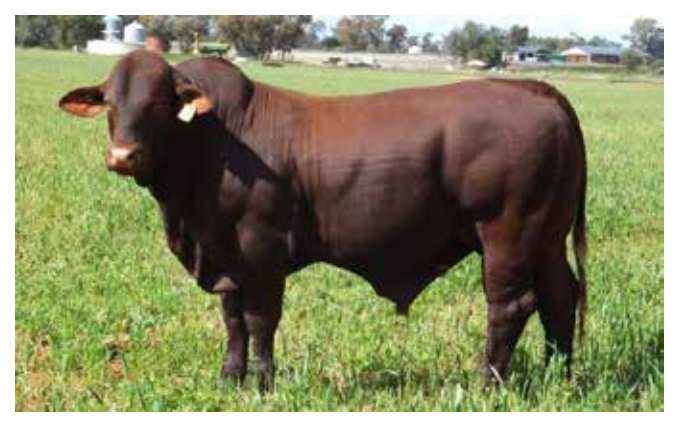
Rockingham Rocco R200 (P) - Lot 21