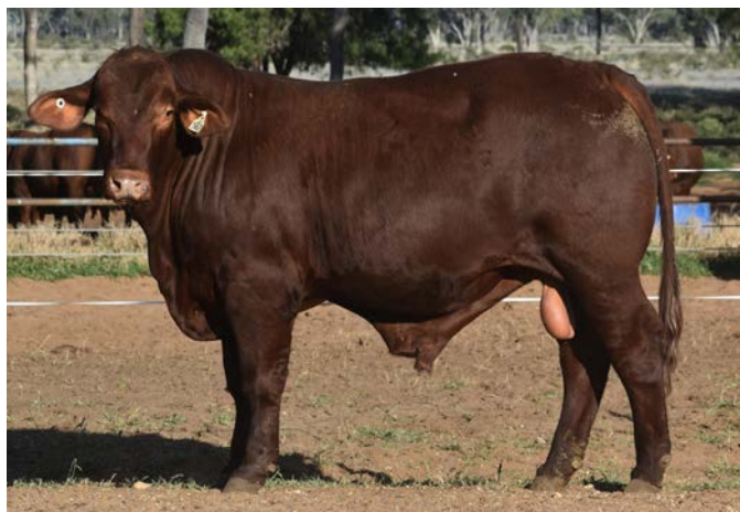
Lot 24 DRENSMAINE JUMANJI (P) - 21 mths