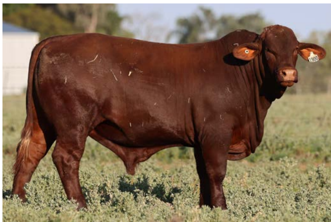
Lot 45 FOREST PARK OKLAHOMA 1900 (P) - 19 mths