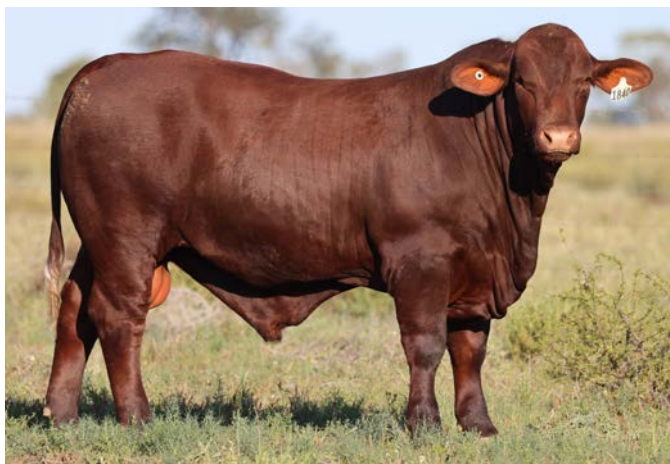
Lot 39 FOREST PARK OTHELLO 1840 (PP) - 19 mths