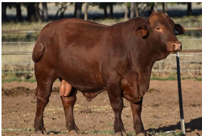
Lot 2 DRENSMAINE JACKPOT (P) - 24 mths