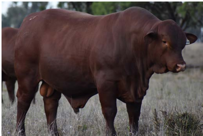
Lot 29 DRENSMAINE JAVA (P) - 23 mths