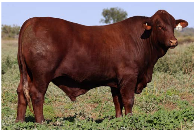
Lot 48 FOREST PARK ODIN 1935 (PP) - 19 mths