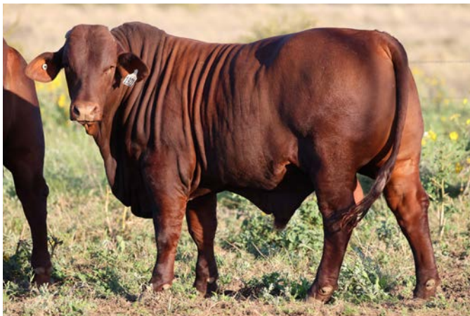
Lot 49 FOREST PARK OBSIDIAN 1921 - 18 mths