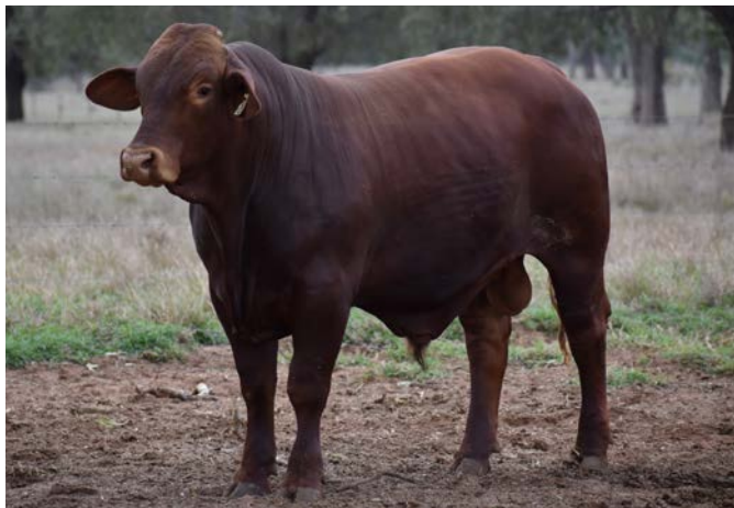
Lot 13 DRENSMAINE JIM BEAM - 24 mths