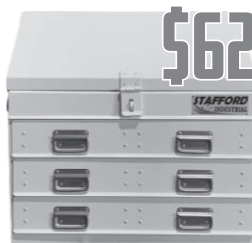
3 DRAWER UTE BOX