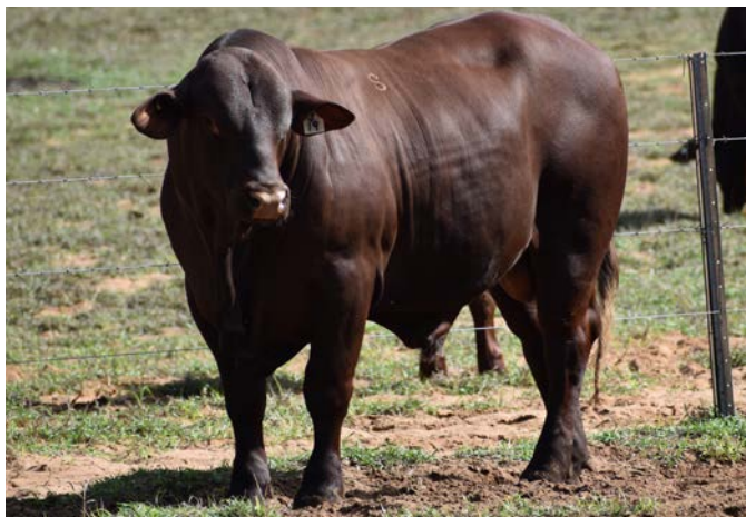
Lot 79 DRENSMAINE JACKHAMMER (PS) - 24 mths