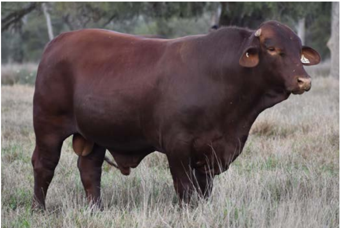
Lot 6 DRENSMAINE JOHNNY CASH (Ps) - 24 mths