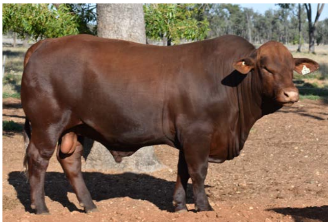
Lot 4 DRENSMAINE JAVELIN (P) - 24 mths