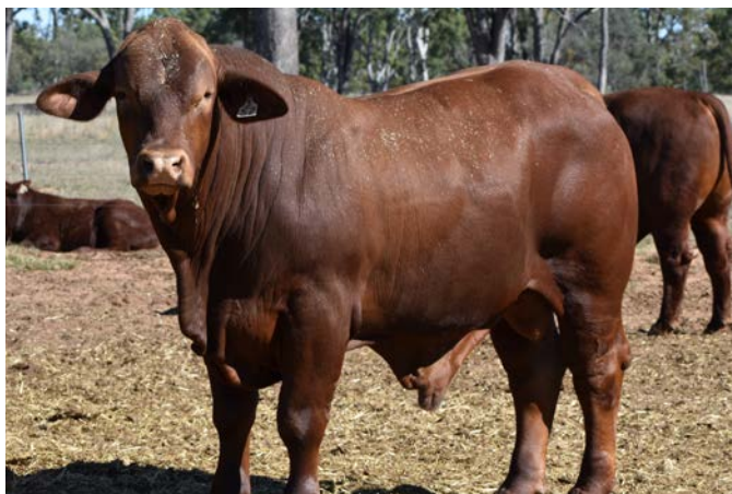
Lot 30 DRENSMAINE JUDAS (P) - 24 mths