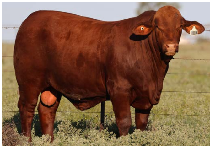
Lot 51 FOREST PARK OWEN 1804 (PP) - 19 mths