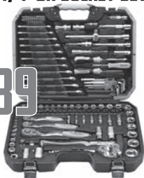
132PCS 1/2" & 3/8" & 1/4" DR SOCKET SET