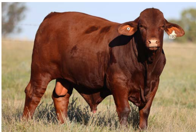
Lot 41 FOREST PARK OTTAWA 1953 (P) - 18 mths