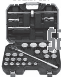
27PCS 3/4" DR SOCKET SET