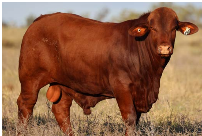
Lot 42 FOREST PARK OCTOBER 1902 (P) - 19 mths