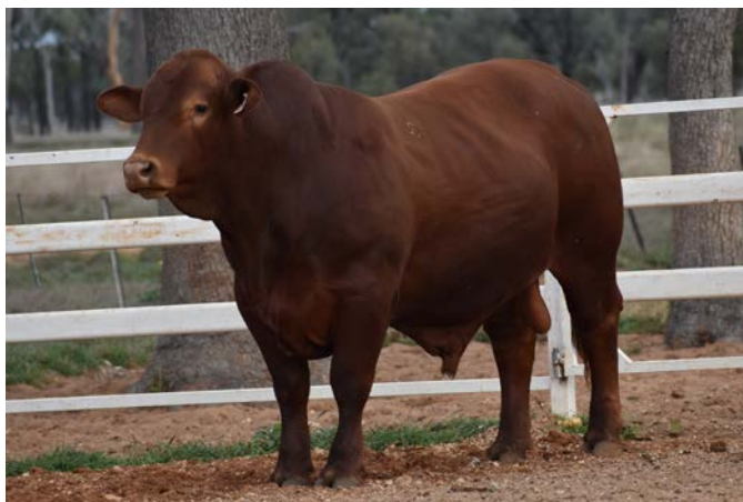
Lot 3 DRENSMAINE JUSTICE (P) - 25 mths