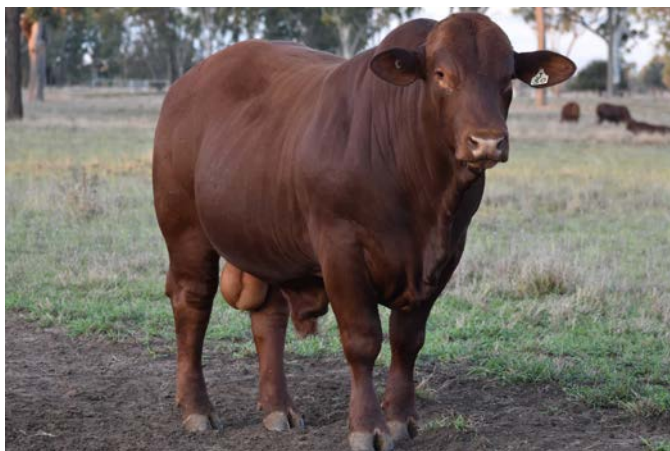
Lot 23 DRENSMAINE JAFFA (P) - 24 mths