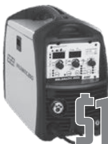
WELDMATI 200 I