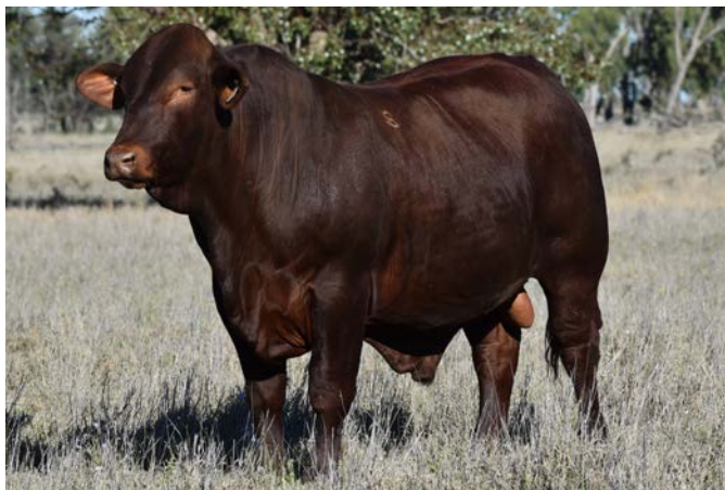
Lot 21 DRENSMAINE JOHNNY REB (P) - 23 mths