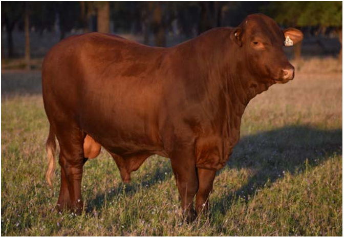
Lot 5 DRENSMAINE JOHNNY BE GOOD - 24 Mths