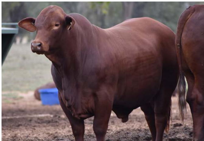
Lot 1 DRENSMAINE JUBILEE (P) - 22 mths