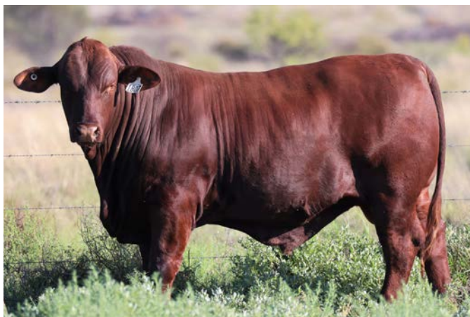
Lot 54 FOREST PARK ORINOCO 1807 (P) - 17 mths