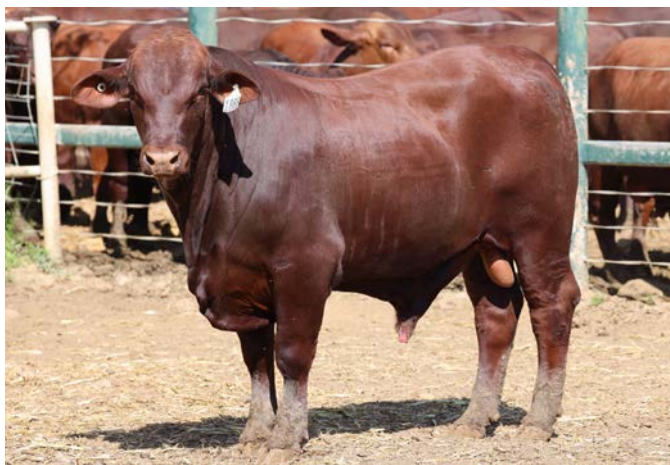
Lot 57 FOREST PARK OODNADATTA 1866 (P) - 20 mths