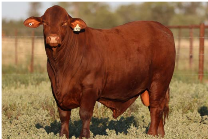
Lot 33 FOREST PARK OCTAGONAL 1723 (PS) - 23 mths