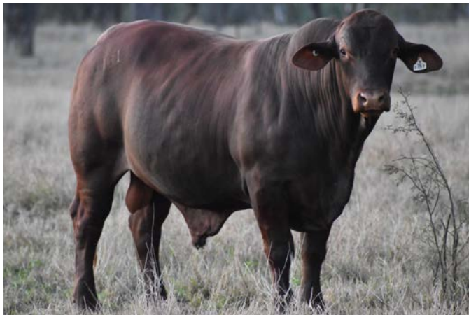
Lot 78 DRENSMAINE JAGUAR (P) 24 mths