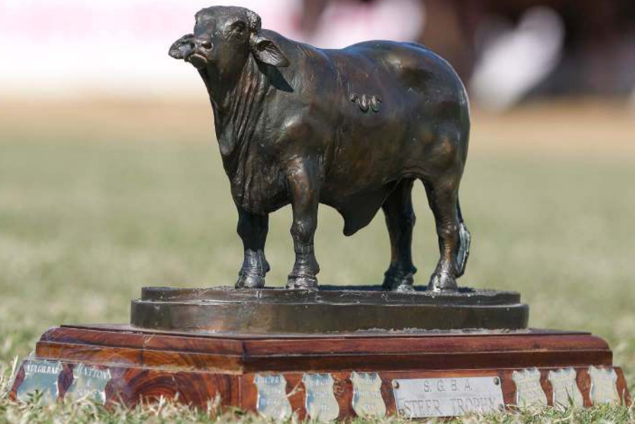
SGBAA National Steer Trophy . Winners 2018 & 2021