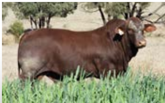
POWER HOUSE [21 MTHS]