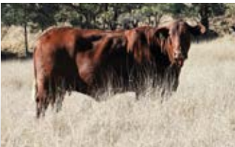
DAM - JAYDE [5.5 YRS]