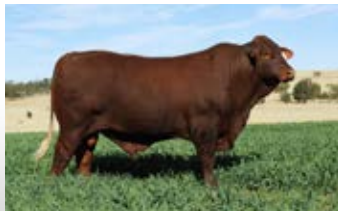
MATERNAL BROTHER [$12000]