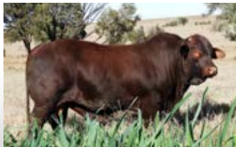
PISTOL [20 MTHS]