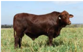
PENTHOUSE [19 MTHS]