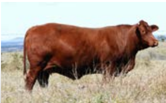
DAM - WILMA [3.5 YRS]