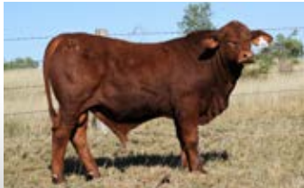
PLAYER [10 MTHS]