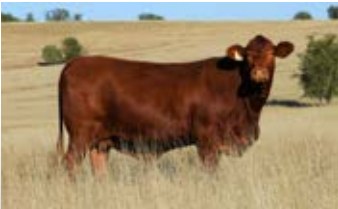
DAM - KEEPER [5 YRS]