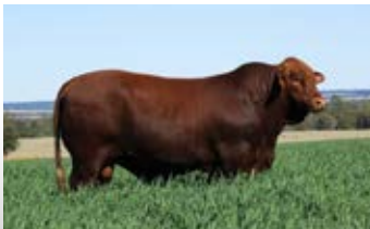
FULL BROTHER [$14000]

11/03/16, 07/08/17, 05/10/18, 24/12/19, 04/11/20, 28/09/21