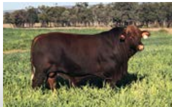
Y505 [22 MTHS]