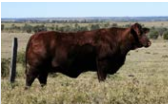
DAM - HEAVEN [8 YRS]

08/10/16, 04/09/17, 11/10/18, 22/09/19, 24/10/20, DONOR