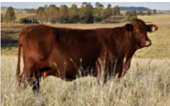
DAM - EMPRESS [8 YRS]

29/07/13, 31/08/14, 21/09/15, 30/08/16, 04/09/17, 15/08/18, 26/09/19, 19/10/20, 08/09/21