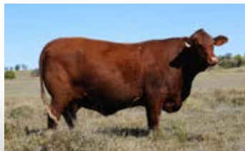
DAM - KLEOPATRA [5.5 YRS]