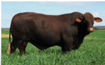
MATERNAL BROTHER [$17500]