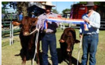
KLEOPATRA & MADONNA