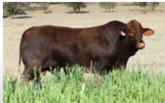
PRINCE [20 MTHS]