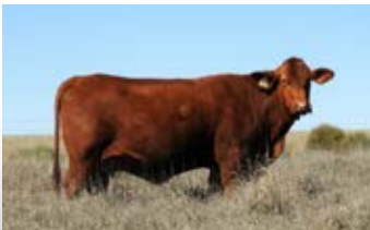
DAM - JADE [7 YRS]