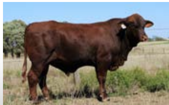
PANTHER [10 MTHS]