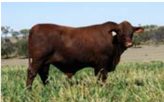
PADRE [19 MTHS]