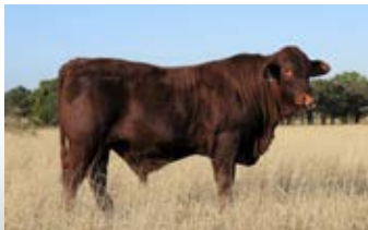
PLATINUM [11 MTHS]