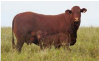
GRAND DAM - FELICIA [4 YRS]

29/10/16, 08/11/17, 07/10/18, 03/09/19, 23/09/20, 10/09/21