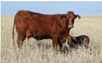
KINDNESS & NEWBORN PLATINUM