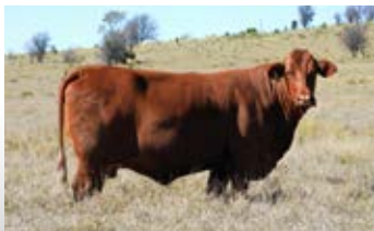
DAM - HONEST [9 YRS]

01/04/16, 23/08/17, 17/08/18, 10/09/19, 28/10/20, 28/09/21