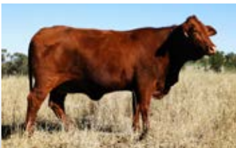
DAM - HANAH [5 YRS]

11/03/16, 07/08/17, 05/10/18, 24/12/19, 04/11/20, 28/09/21