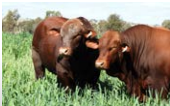
LOT 4 & PATRIOT