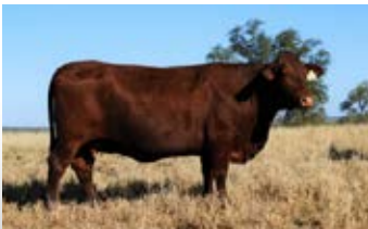
DAM - GINGER [8 YRS]

16/03/16, 01/09/17, 20/10/18, 19/09/19, 26/09/20, 26/09/21