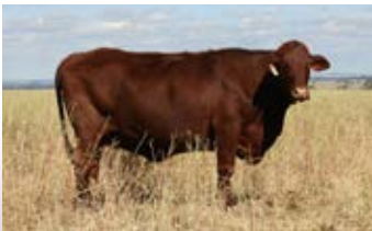
DAM - DAZZLE [10.5 YRS]

10/04/12, 18/06/13, 09/08/14, 09/09/15, 06/10/16, 14/08/17, 30/09/18, 05/10/19, 21/10/20