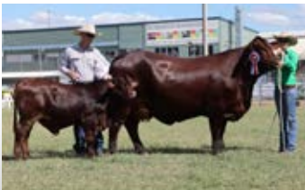
GRAND DAM - IMPRESS [3.5 YRS]