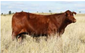
DAM - JANE [5 YRS]

31/03/16, 05/09/17, 16/09/18, 07/09/19, 18/09/20, 15/09/21