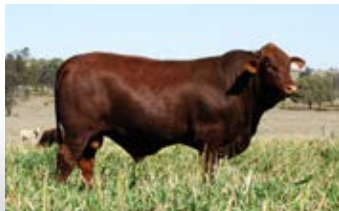
PAPENHUYZEN [19 MTHS]