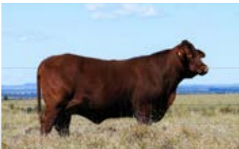
DAM - HAPPY [8 YRS]

14/03/17, 08/02/18, 03/09/19, 12/10/20, 26/10/21