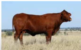
DAM - INDIGO [7 YRS]

08/03/17, 04/08/18, 01/09/19, 23/09/20, 09/09/21