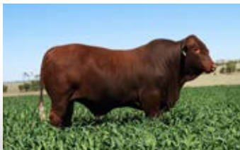
MATERNAL BROTHER [$16000]