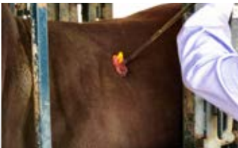
THE STAMP OF APPROVAL