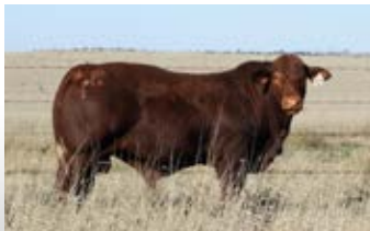
PRODUCER [10 MTHS]