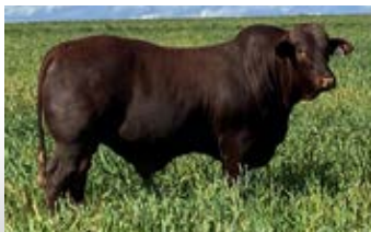
PHANTOM [20 MTHS]