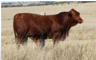
PRIVATE [10 MTHS]