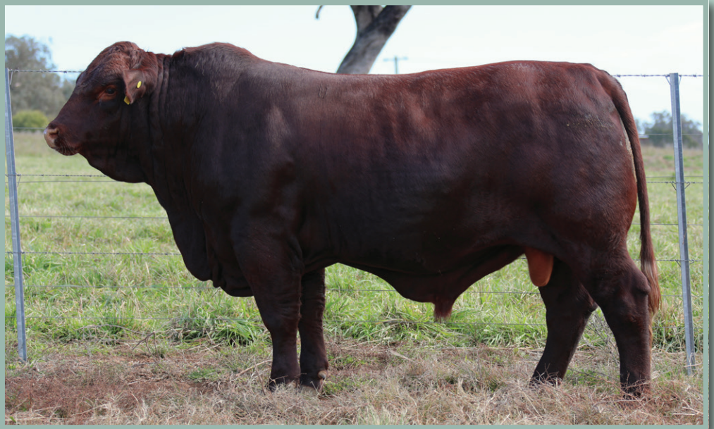
Lot1 Hardigreen Park Robust Q26 (P)