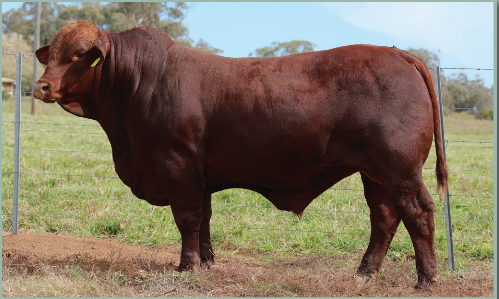
Lot 3 Hardgreen Park Rancher Q66 (PS)