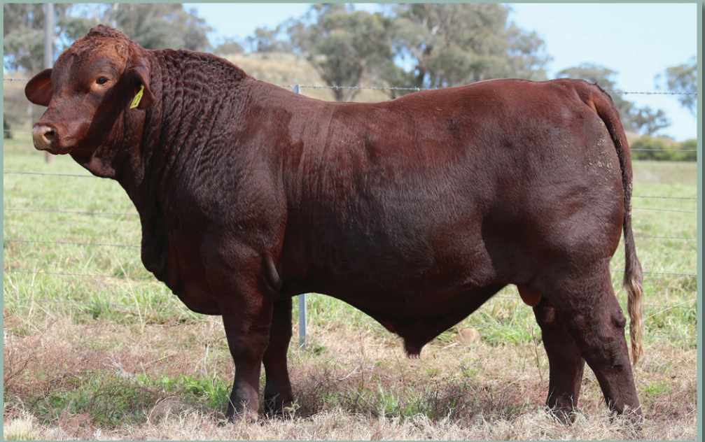
Lot 12 Hardgreen Park Rockstar Q150 (P)