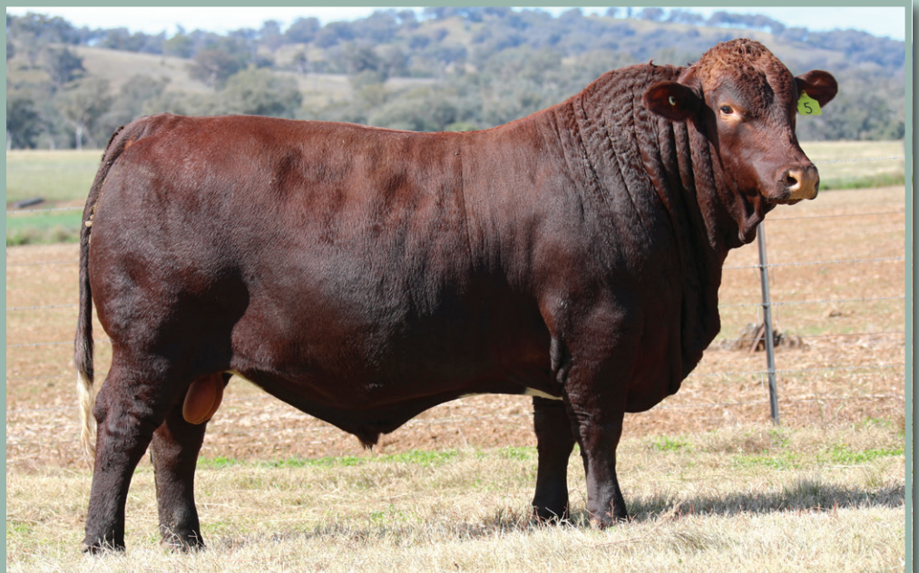
Lot 5 Hardigreen Park Q108 (P)