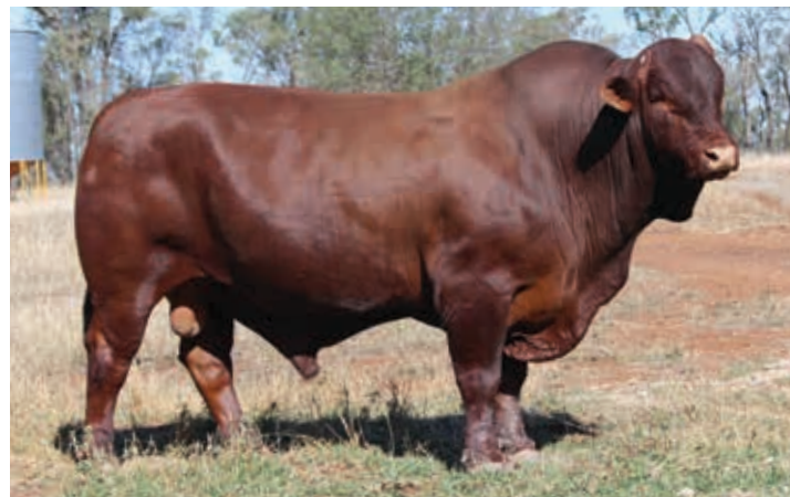
Walmona Xylon (PS)

Lots 3, 4, 11, 12, 13, 14, 23, 47, 50 & 58.