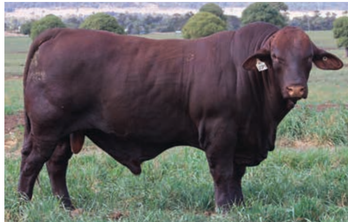
Moongana Leader (P)

Lots 9, 21, 22, 42, 43, 44, 45, 46, 48, 52, 53 & 54