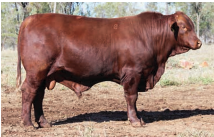
Moongana Jasper (PS)

Lots 10, 29, 30, 31, 36, 37, 38, 40, 41, 49 & 56.