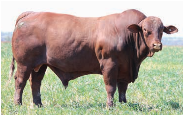
Moongana Harley (P)

Lots 9, 21, 22, 42, 43, 44, 45, 46, 48, 52, 53 & 54