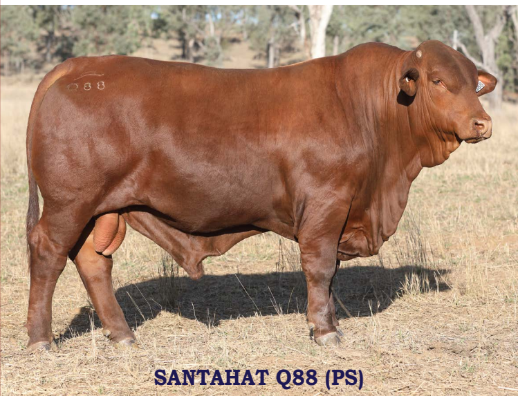
SANTAHAT Q88 (PS)