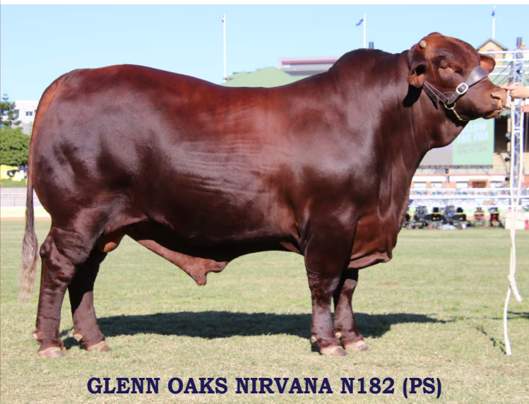
GLENN OAKS NIRVANA N182 (PS)