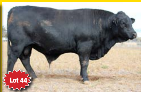
WATASANTA MULBERRY (P) - CN&PH McGuigan $13,000