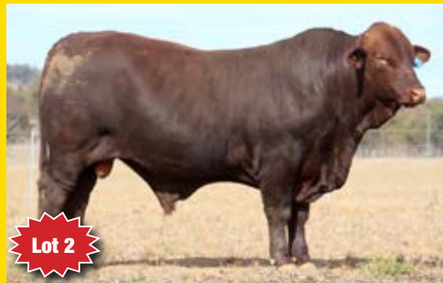
WATASANTA MARVELLOUS 2294 (P) - Torres Park $13,000