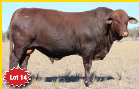
WATASANTA MUSTANG 2318 (P) - Kidman & Co. $18,000