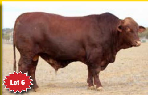
WATASANTA MATCH MAKER 2230 (P) - CD & NM Pearson $16000