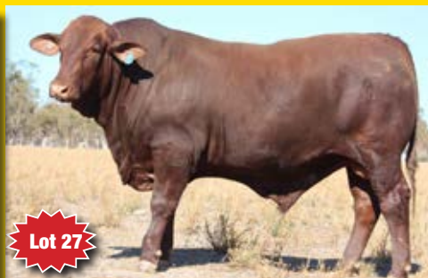
WATASANTA MARMALADE 2270 (P) - CD & NM Pearson $18,000