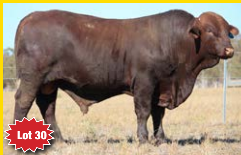
WATASANTA MALLEE BOY 2236 (PS) - JM & SJ Smith $12,000