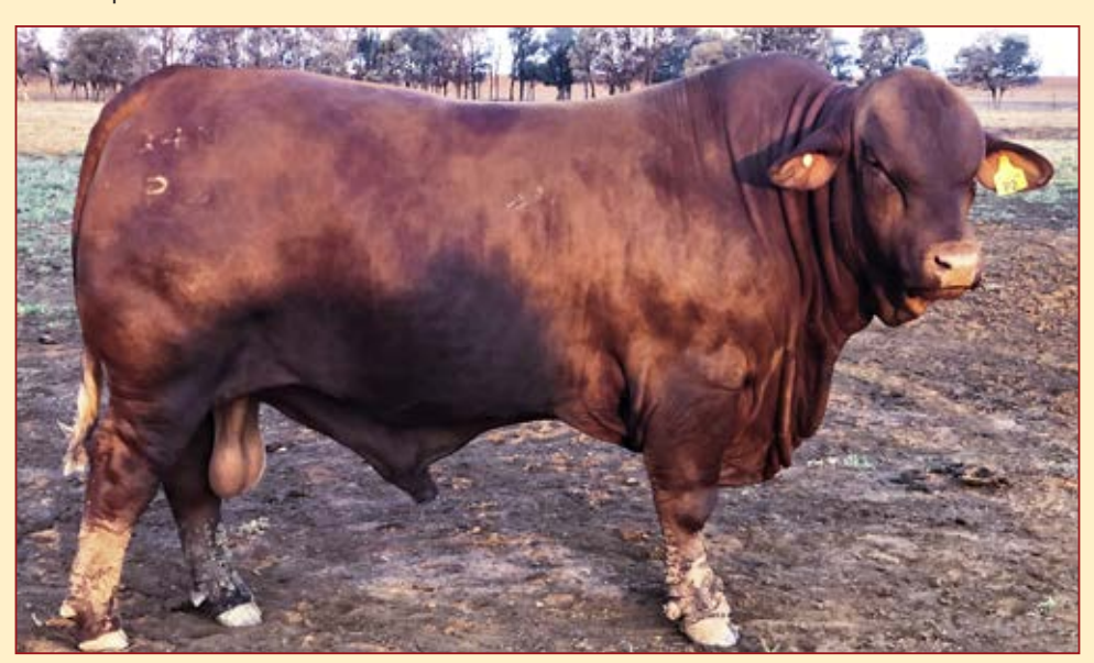
Retained Sire. Bullamakinka Patriot P2(P) Sire: Waco Flynn

Bidders not wanting to use Tablets/phones to bid will still have the ability to have our sale agents/Auctions Plus Representatives to register bids on their behalf if required.