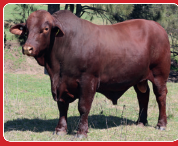
... including a son of Rosevale Park Beaumon K20 purchased by Sutton Beef