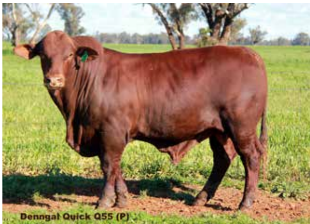
Denngal Quick Q55 (P) – Lot 21