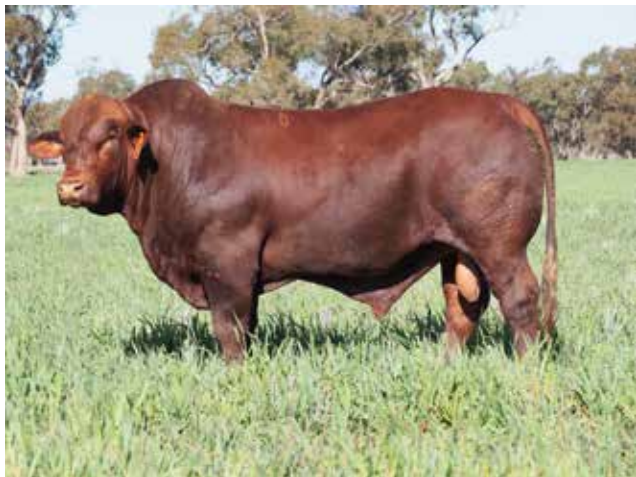
Rockingham Quartz Q8 (P) – Lot 11