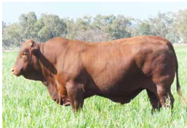
Rockingham Quambone Q126 (PS) – Lot 7