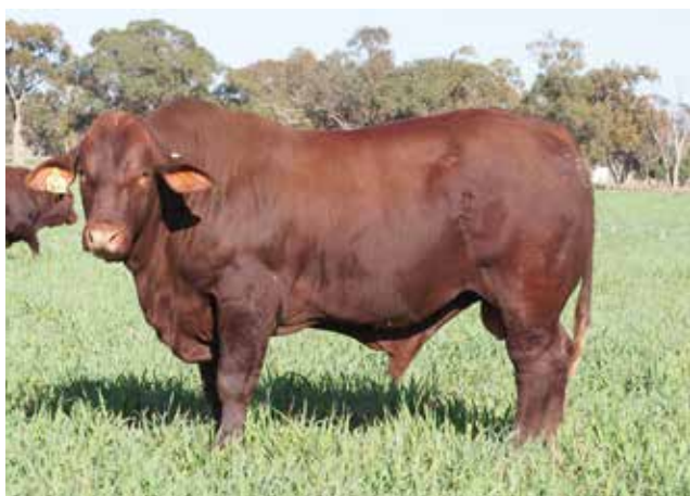
Rockingham Quandong Q146 (P) – Lot 6