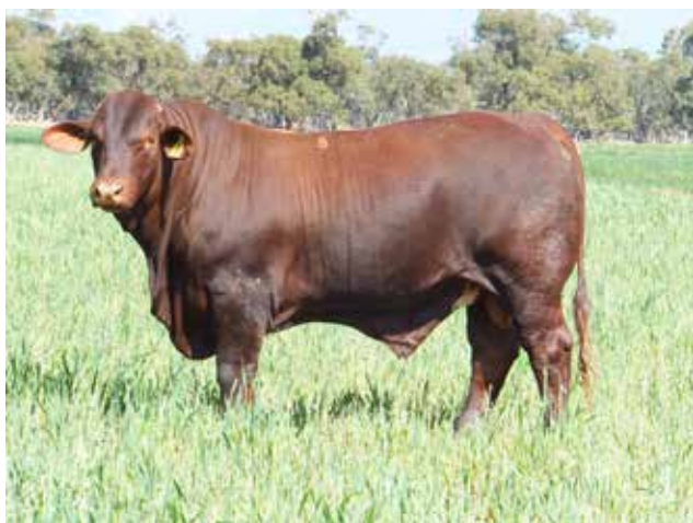
Rockingham Quarantine Q90 (PS) – Lot 3