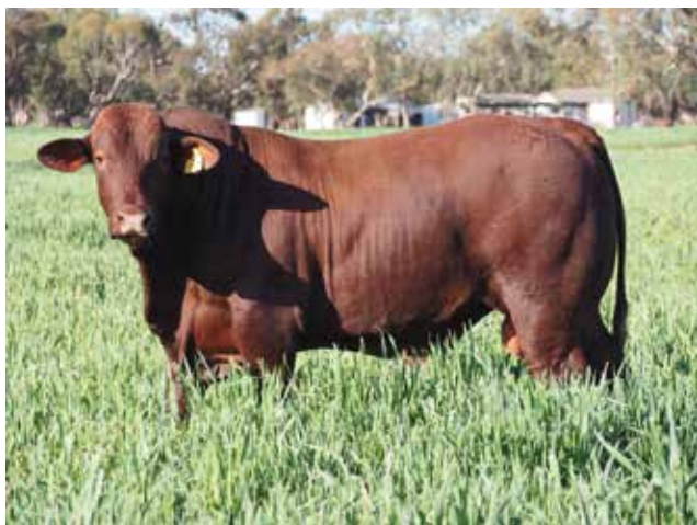
Rockingham Quip Q150 – Lot 31