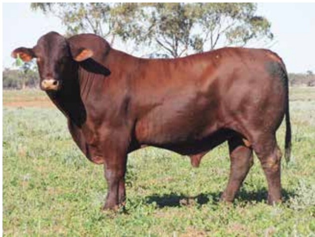
Diamond H Striker S151 (P)