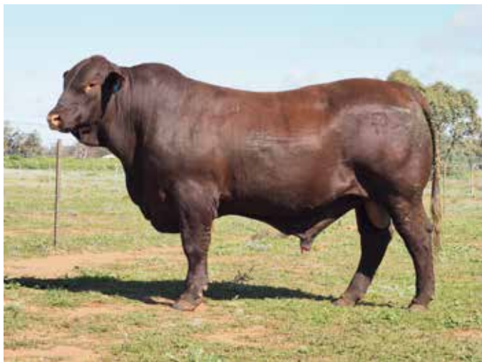
Rockingham Powerhouse (P) 2020 Sale record $70,000