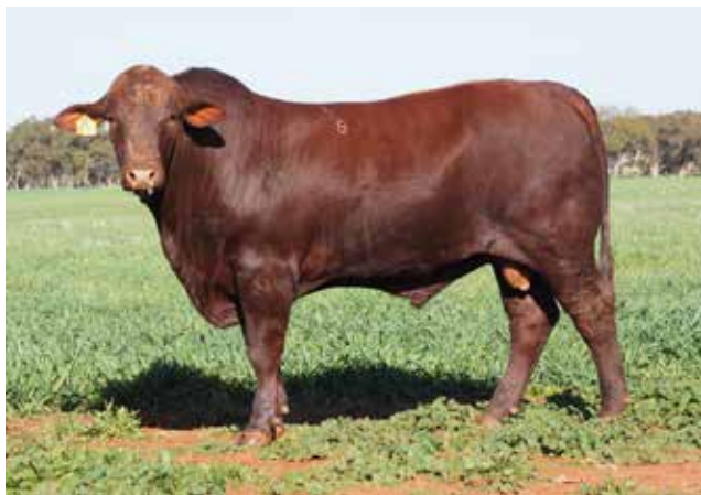
Rockingham Quicksilver Q54 (P) – Lot 5