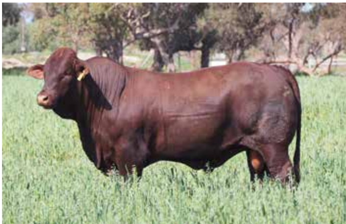
Offering 2021 Full brother Rockingham Qantas Q152 - Lot 2