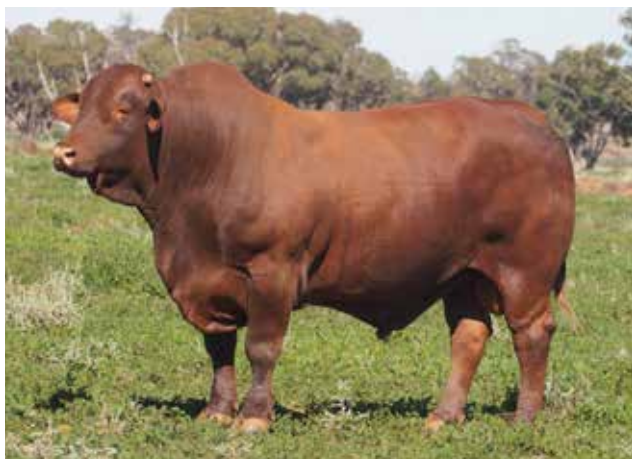
Rockingham Joker J100 (PS)