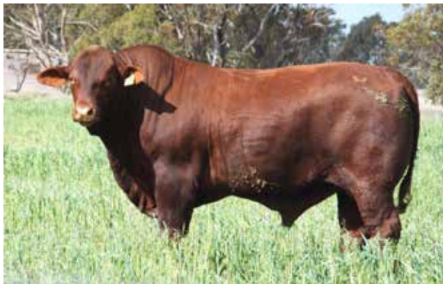
Rockingham Quadtrack Q164 (P) – Lot 8