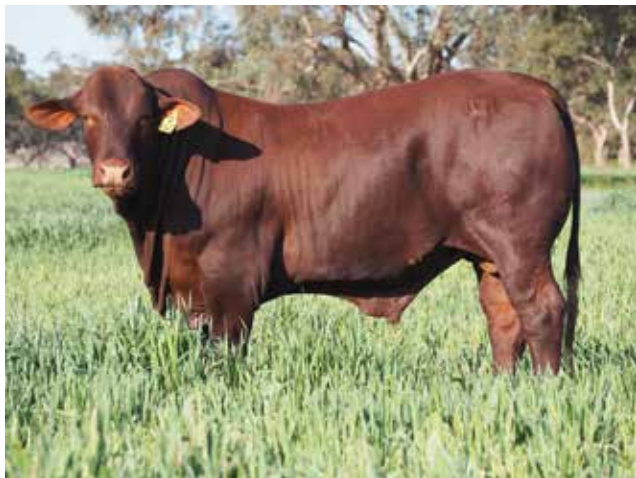
Rockingham Quake Q168 (P) – Lot 1