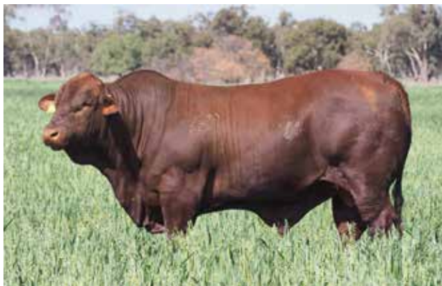
Rockingham Quicksand Q136 (PS) – Lot 4