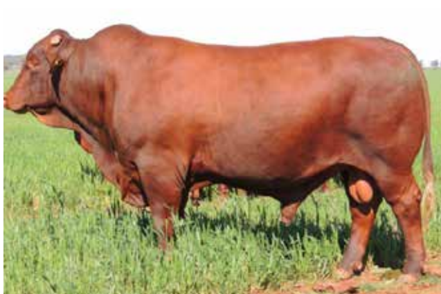
Rockingham James Bond J106