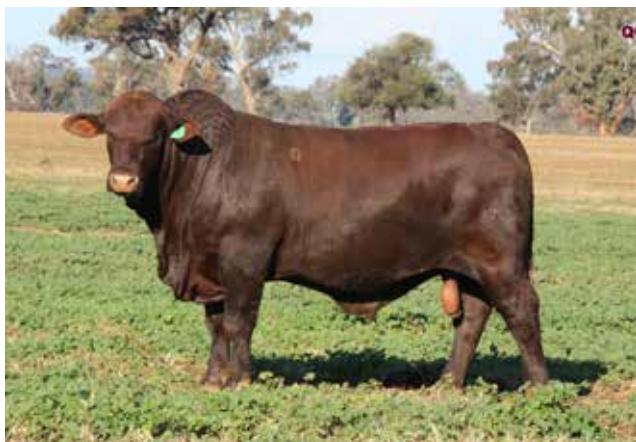
Denngal Quartet Q65 (P) – Lot 23