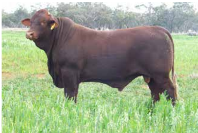
Rockingham Quatro Q114 – Lot 29